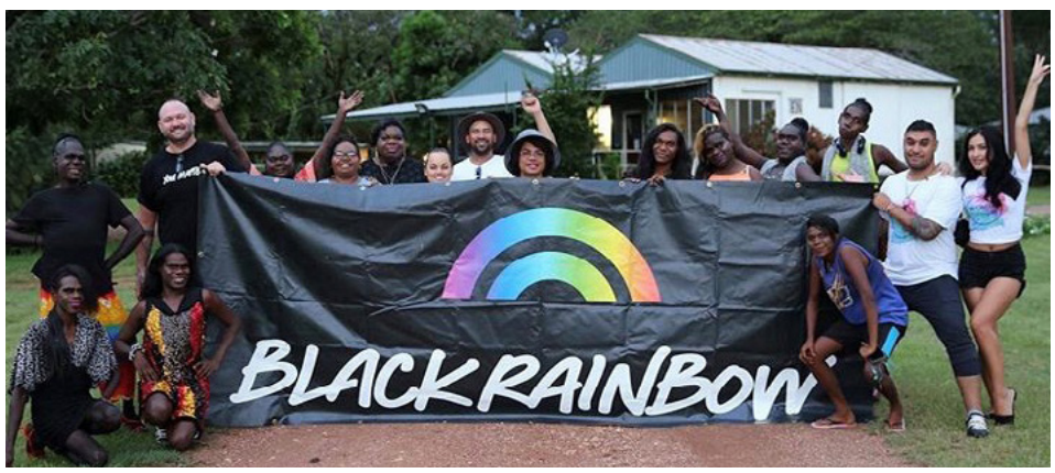
Black Rainbow

The Futures Fund has been created to support self-selected career development and enhancement opportunities across all professions for Indigenous LGBTIQSB community members aged 15-35 years. From 2021-25, Black Rainbow will provide grants of up to $1000 to four Indigenous LGBTIQSB recipients each year with 20 individual grants in total. Read more here.